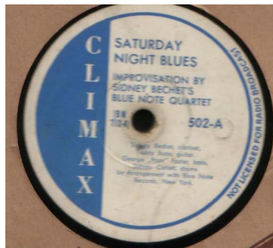
Figure 2: A record issued by a subsidiary of the well-known independent label, Blue Note. This only states that the record may not be broadcasted on the radio.