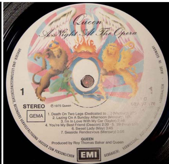
Figure 8: A 1975 German issue states that copying (except for personal use) is prohibited. This kind of information is included on recordings from other labels in Germany around this period. Polydor labels are more boring than this one.