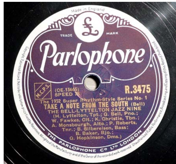
Figure 4: This 1952 British recording prohibits unauthorised public performance, broadcasting and copying.