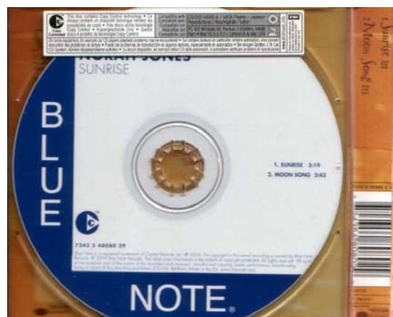
Figure 10: A new, copy controlled CD. Not only is unauthorised copying, public performance, hiring or rental prohibited, but the label contents are also copyrighted. In addition the medium is copy-controlled and the label at the top of the picture bears the warning: "On some equipment, for example car CD players, playback problems may be encountered". The album from which the single CD is taken contains a compressed version of the music and a special player which installs itself when the CD is inserted in a computer drive. It didn't work when I made an attempt to play it on my Sony computer and there is a rumour that HMV's player contains a virus. At any rate, Blue Note is no longer independent (see figure 2) but belongs to EMI.