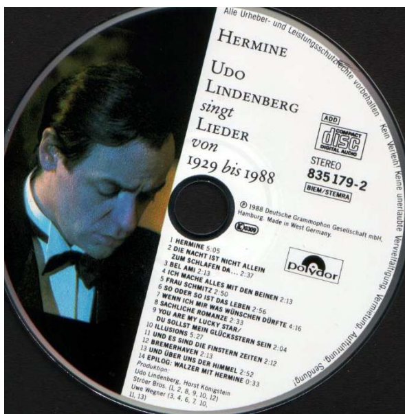
Figure 9: In the CD era now, this German recording makes no exception to the ban on copying. This one states that copying without permission is prohibited. An innocent customer might assume (s)that he has to ask for permission. Otherwise the record company assumes that customers know which rights they have. .