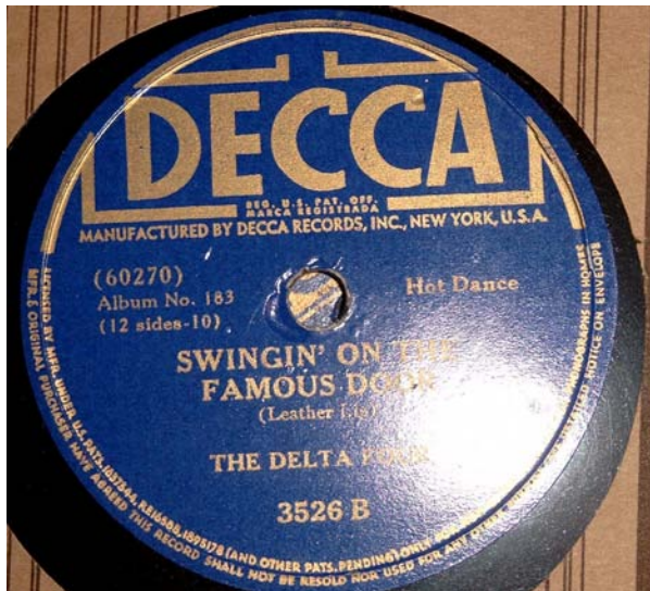
Figure 3: This US recording contains a lot of information including patents going on to state that it is licensed only for non-commercial use for phonographs in homes. The second line tells us that "Mfr. & original purchaser have agreed this record shall not be resold nor used for any other purpose..." (Making flower bowls of unwanted records was popular in the 1950s).