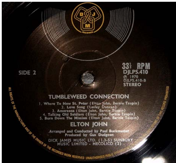
Figure 7: This early British recording (1970) by Superstar Elton John prohibits copying.