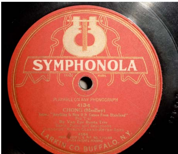
Figure 1: A c. 1920 recording only referring to the trade mark on the (long defunct) label's name. (The rights are probably still claimed by BMG-Sony, Time-Warner or someone else).