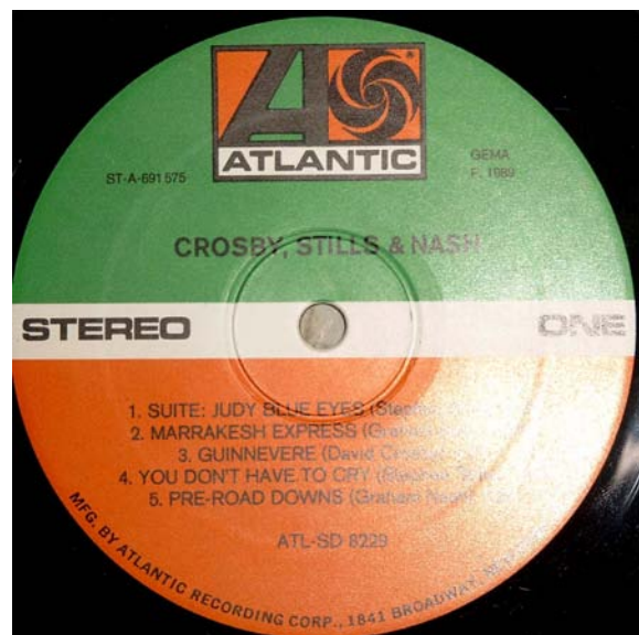
Figure 6: Now we're in the LP era. This German release on the then independent Atlantic label has no restrictions at all. There is also no information on the cover or inner sleeve. The 1960s and early 1970s were regarded by many as the heyday of the recording industry. American records bore no different information.